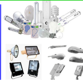
LED/HID based Industrial Luminaires Entire range of Lighting Products