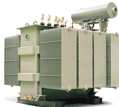
Power Transformer upto 315MVA & Distribution Transformer upto 2000kVA