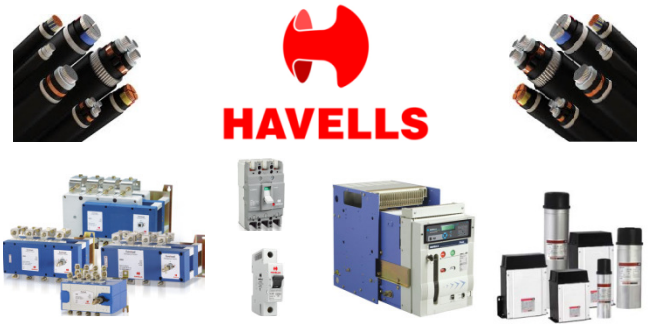
LT Switchgear MCB, MCCB, ACB, Contactor, Changeover Switch, Capacitors and HT LT Industrial Cables