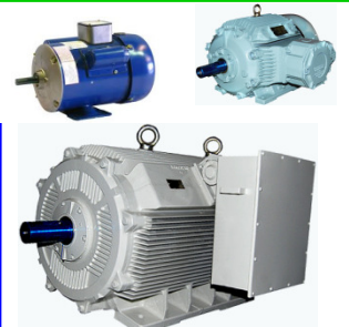
HT/LT Industrial Heavy Duty Motors